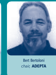
Bert Bertoloni chair, ADEPTA

Featuring a unique blend of top level plenary addresses, problem-solving workshops and best practice and technical guidance, the conference will cover: